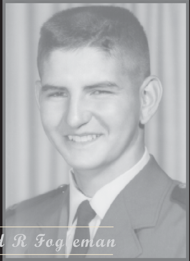
General Ronald R Fogleman